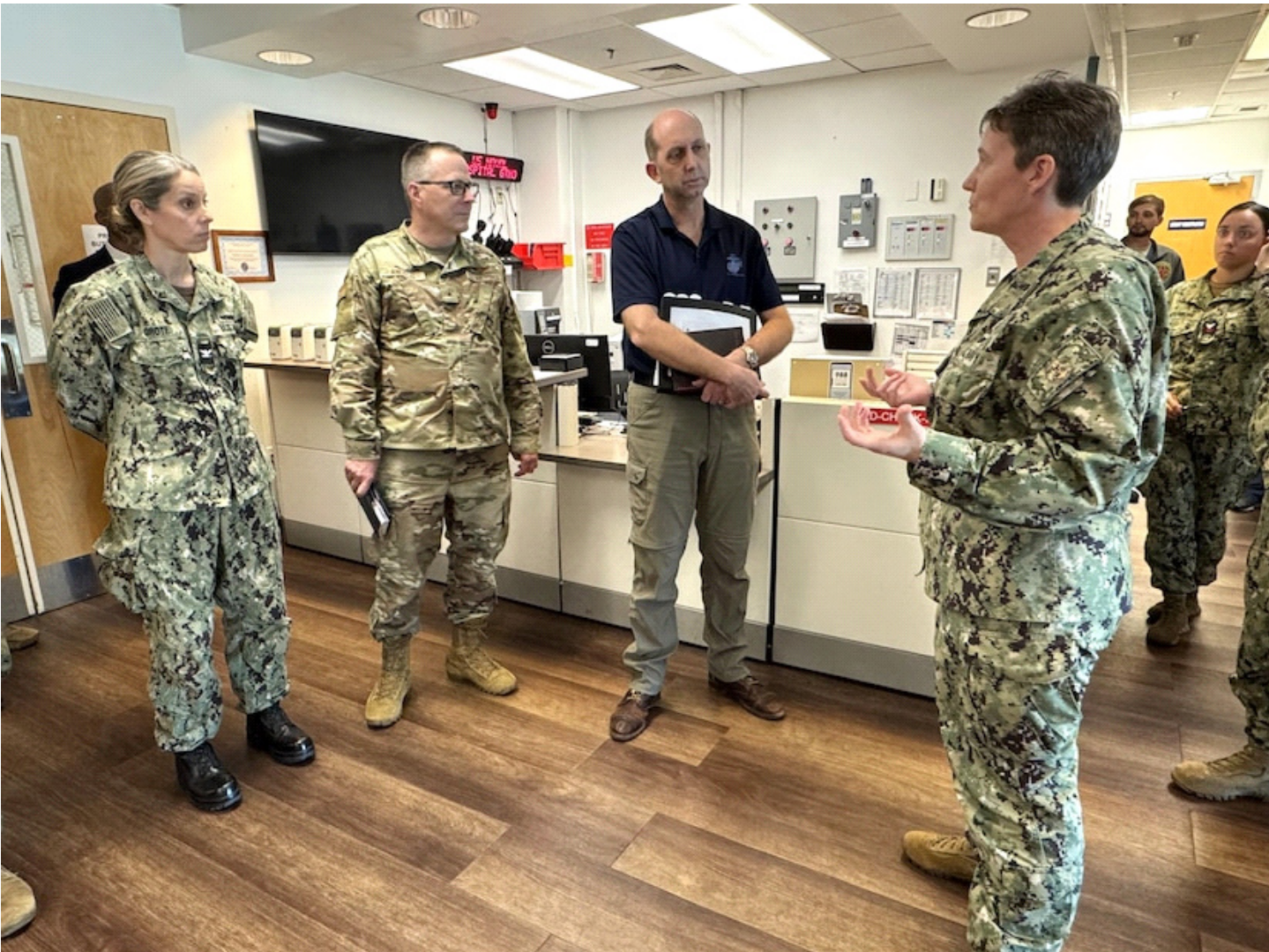
Staff listens to sage advice on military readiness.

Navy surgeon. "When America's sons and daughters go downrange and go into harm's way, we honor the pact we made with them and with their parents, that should they become ill or injured, they will receive prompt and effective medical attention anywhere in